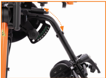
LEG PIVOT POINTS