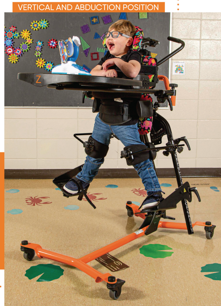
VERTICAL AND ABDUCTION POSITION