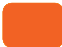
ORANGE (Size 1 and Size 2)