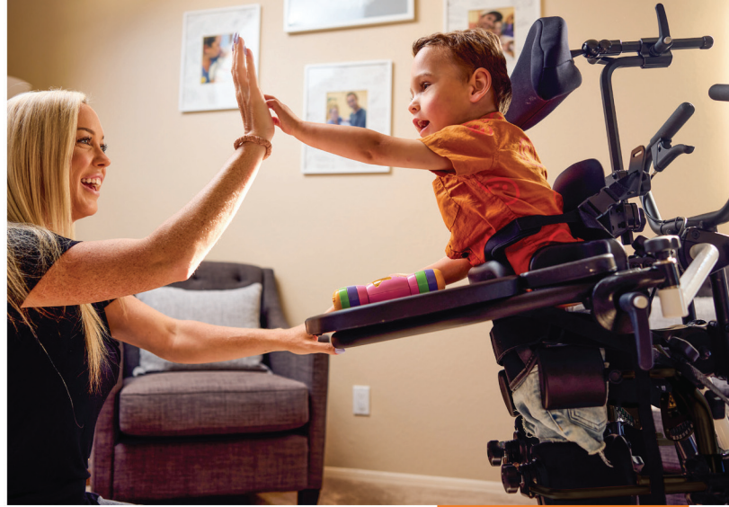
20° PRONE POSITION