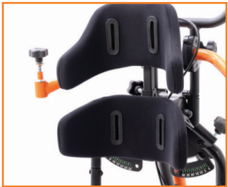
FORM TO FIT PADS