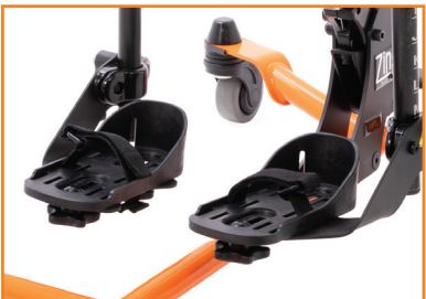
MULTI-ADJUSTABLE FOOT PLATES