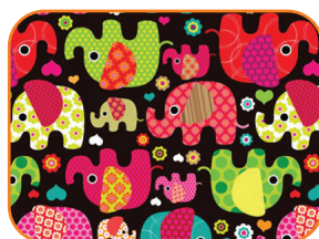
FANCY PANTS ELEPHANTS