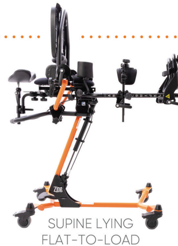
SUPINE LYING FLAT-TO-LOAD