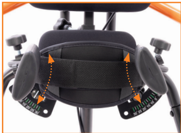
ROTATING HIP GUIDES