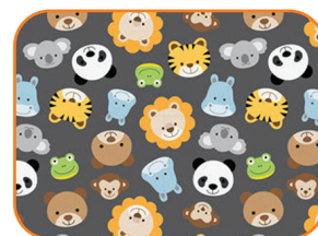
ALL SMILES ANIMALS