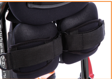
PLANER PADS WITH KNEE STRAPS