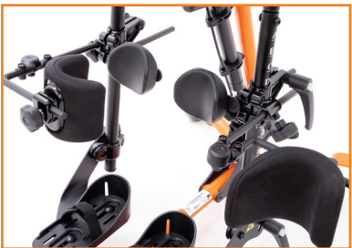
ASYMMETRIC KNEE PADS