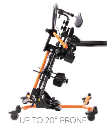
UP TO 20° PRONE