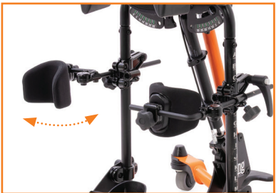
MULTI-ADJUSTABLE SWING-AWAY KNEE PADS