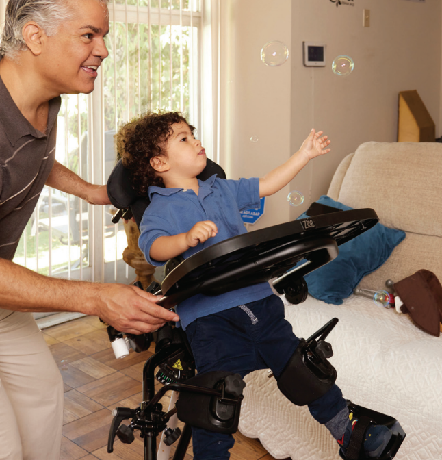
SUPINE AND ABDUCTION POSITION