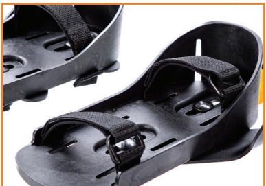
SECURE FOOT STRAPS