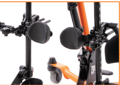
MULTI-ADJUSTABLE CALF PADS