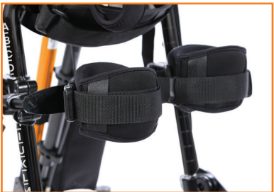
POSTERIOR KNEE PAD WITH STRAPS