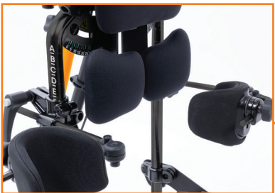
TT PLANAR LEG SUPPORT