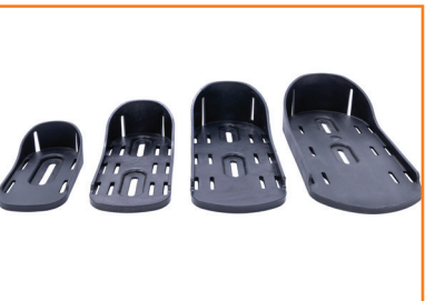
MULTIPLE FOOT HOLDER SIZES