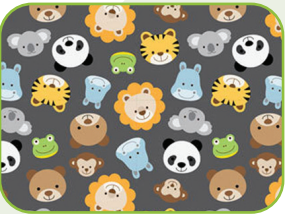
ALL SMILES ANIMALS