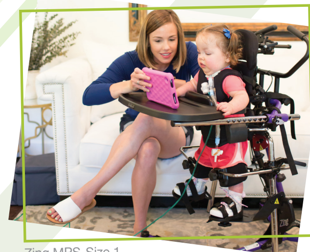
Zing MPS-Size 1