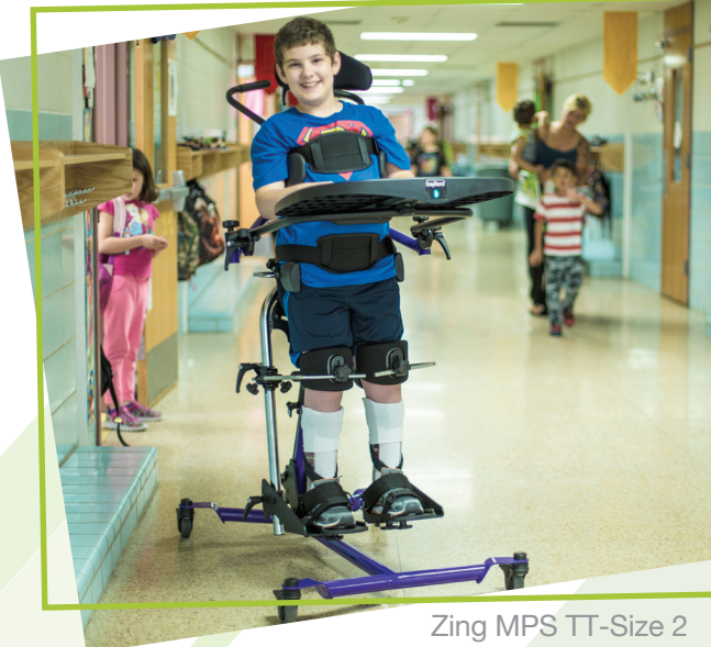
Zing MPS TT-Size 2