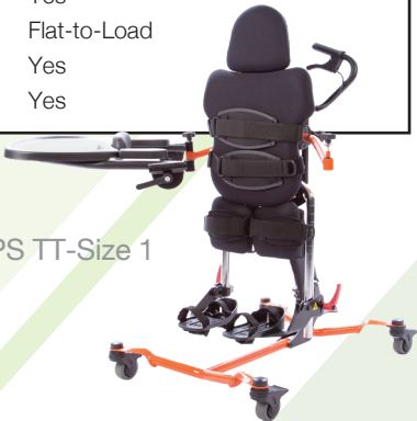
Zing MPS TT-Size 1