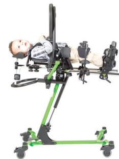
Supine Lying - Flat-to-Load