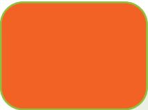
ORANGE (Size 1 and Size 2)

Altimate Medical, Inc. 262 West First Street Morton, MN 56270 USA Tel: 800.342.8968 507.697.6393 Fax: 877.342.8968 507.697.6900 info@zingstanders.com zingstanders.com