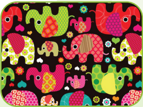
FANCY PANTS ELEPHANTS