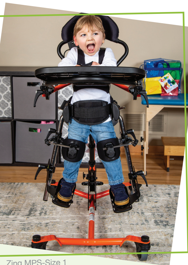
Zing MPS-Size 1